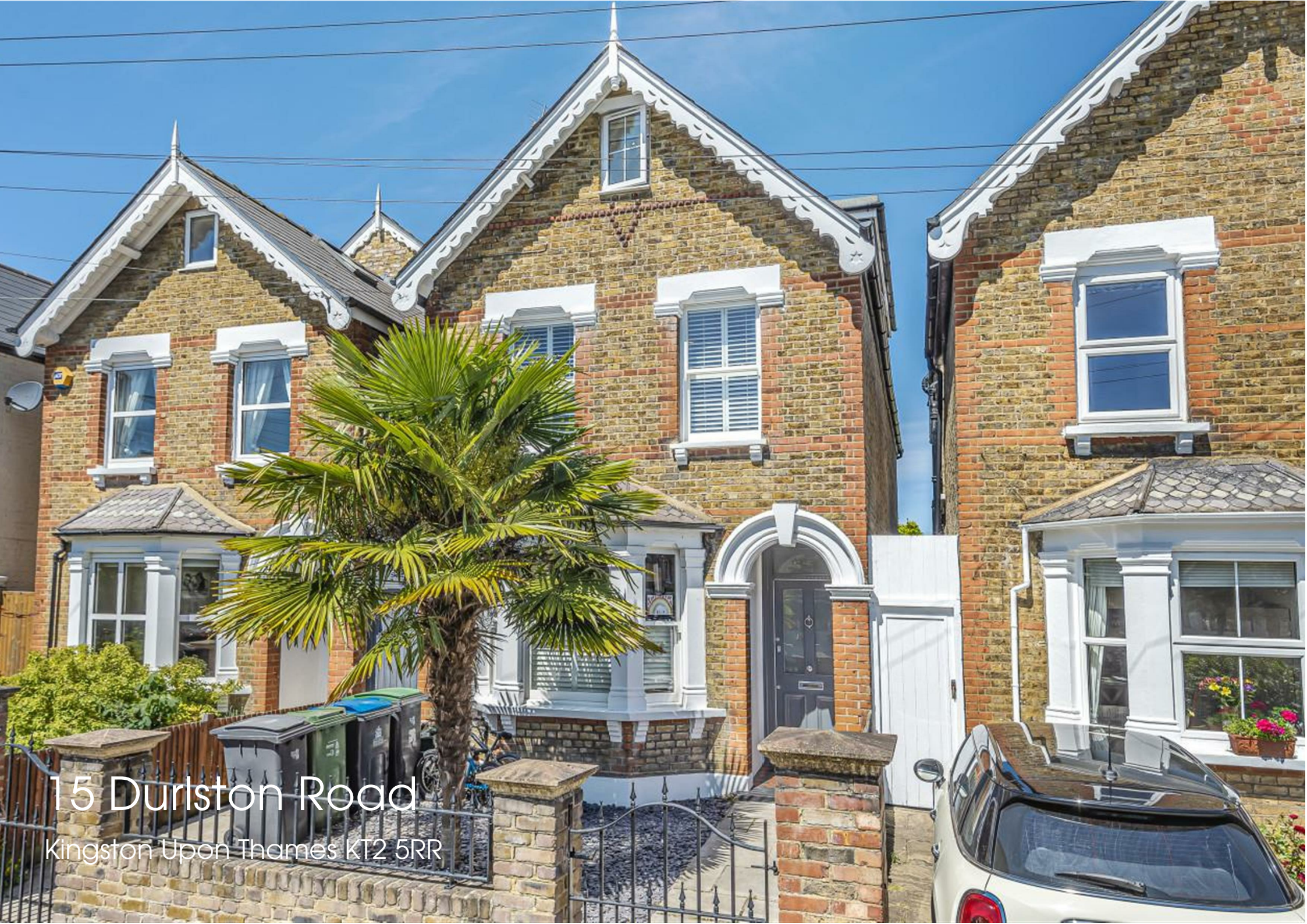
15 Durlston Road Kingston Upon Thames KT2 5RR

34 Richmond Road Kingston upon Thames Surrey KT2 5ED www.gibsonlane.co.uk Tel: 020 8546 5444